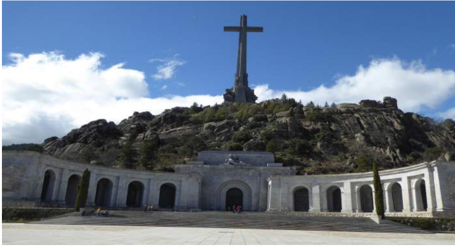
The Basilica at the Valley of the Fallen