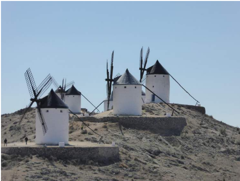
Don Quixote's 'monsters'.

Next, we could not miss out Consuegra where the famous 'tilting at windmills' took place and Cervantes Don Quixote sought to attack his imaginary enemies. Below is Calderico hill where the windmills form a unique silhouette across the top together with the Castillo and which makes a wonderful vista to be seen for miles around. There are twelve windmills remaining out of the original 13 and four still retain the complete machinery. One is a tourist office and one is an outrageously priced gift shop where we could not resist buying a Don Quixote memento for this wonderful part of our voyage.