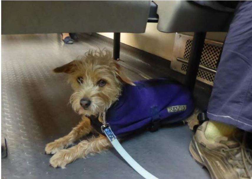
Gracie on the train to Alicante.