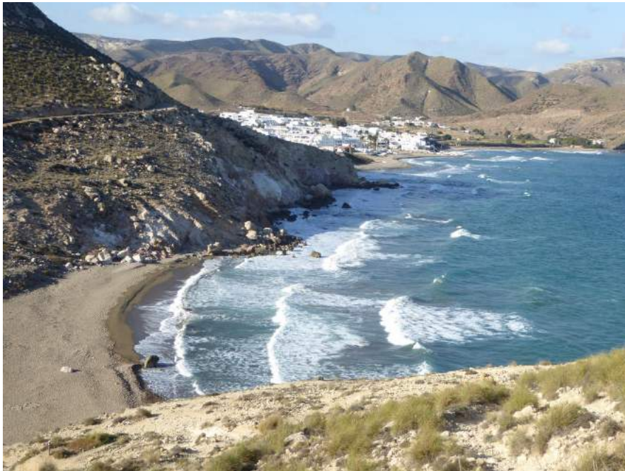
The village of Las Negras.

We continued to camp wild on the sea shores and clamber around the coastal paths. The natural park of Cabo de Gato is a place we love to visit and so we rested on the beach, just west of Las Negras for a couple of nights.