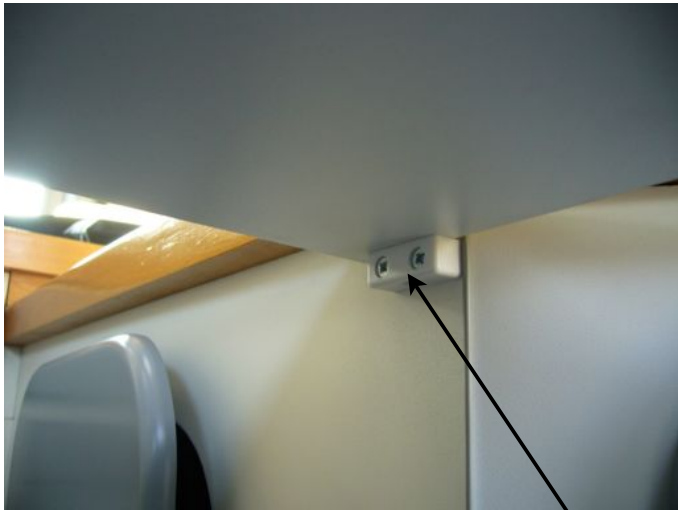
block fixed to cabinet front to rest top on to bear weight