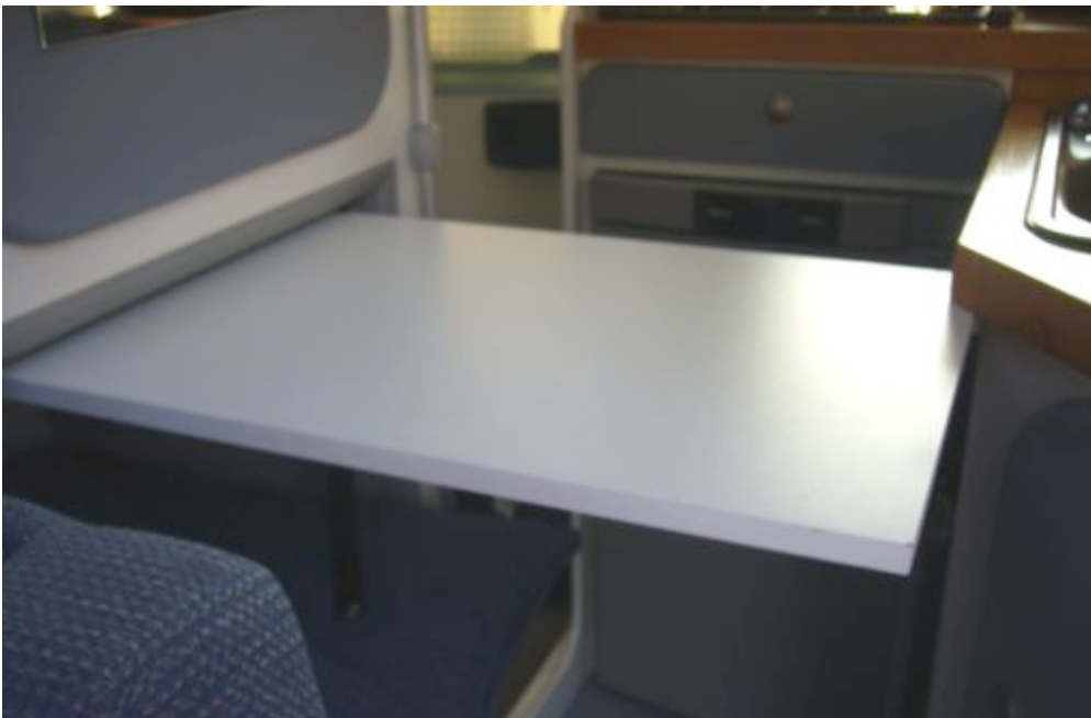
job done. The kitchen of the little chef !